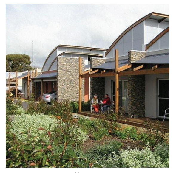
Must @ Coonawarra